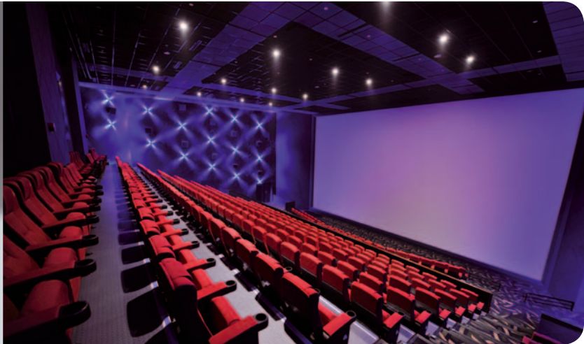
Barco Auro 11.1 audio system at Wangfujing Cineplex, China